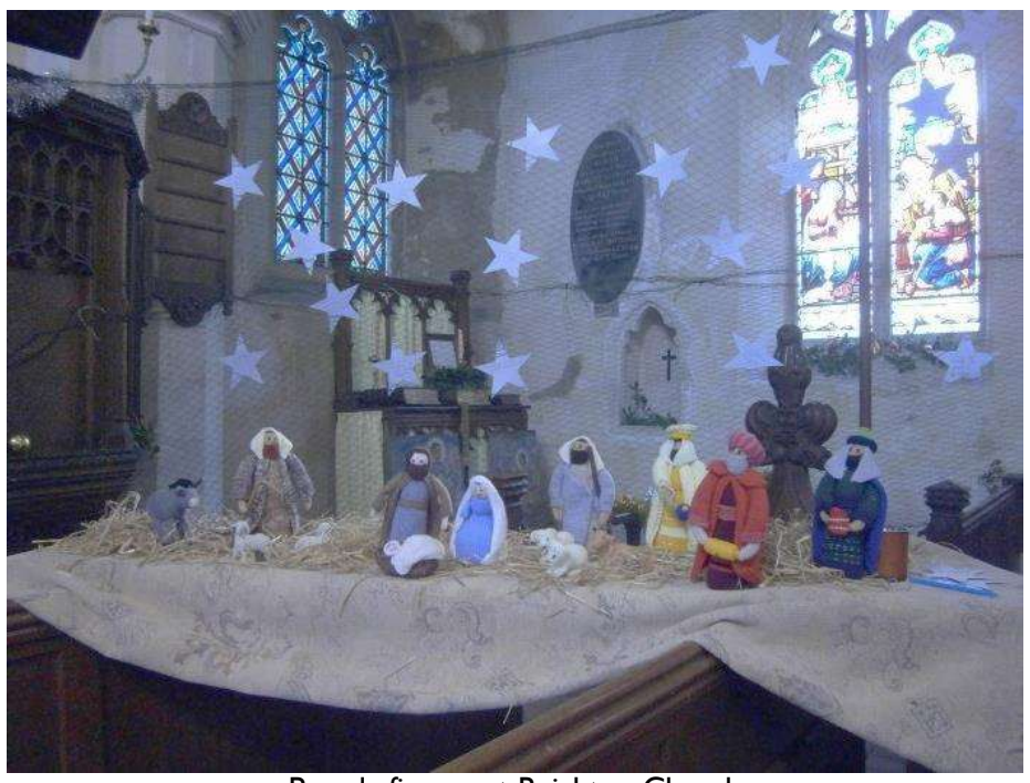
Posada figures at Beighton Church