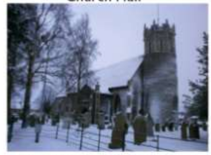
St Edmunds in the snow