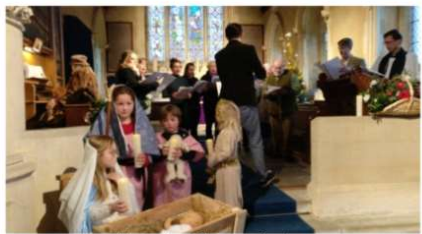
Limpenhoe Christmas Service