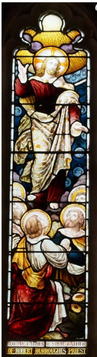
Beighton Windows - Ascension and Pentecost