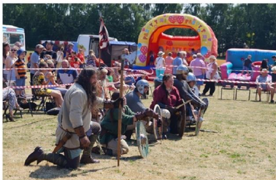
Fun in the sun at Reedham Fete