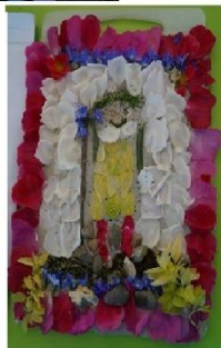
Messy Church Reedham's tribute to 'Old Pottle' - petal pictures to dress his grave