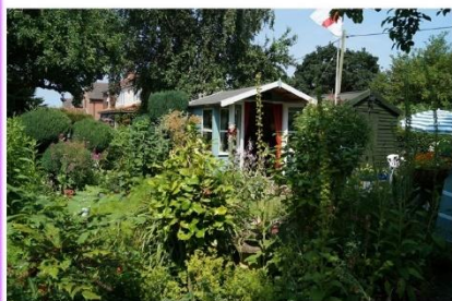
'Secret Gardens' at Beighton 7th July