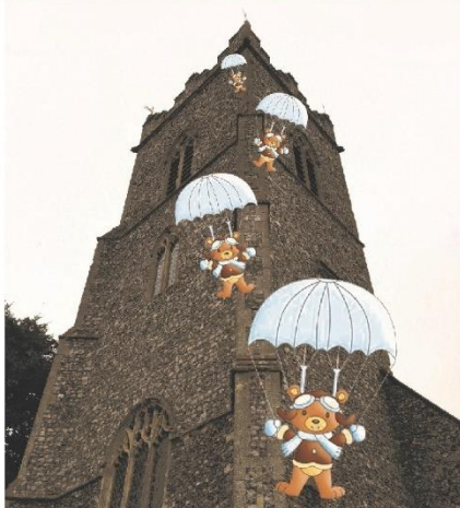
Teddy Bear Parachute Jumping from Wickhampton Church Tower - 5th August! See inside for details.