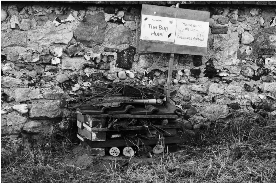
The Bug Hotel as made by First@4/Messy Church