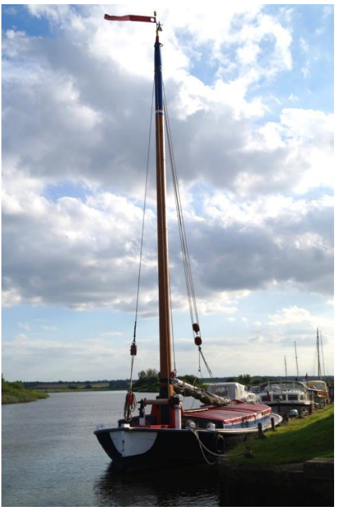
Wherry Albion at Cantley Staithe