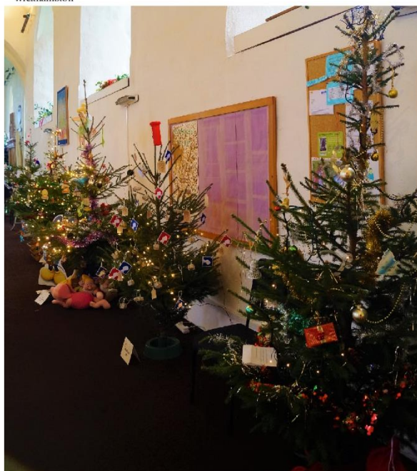
Reedham Christmas Tree Festival 2014 - see inside for details of this year's Festival