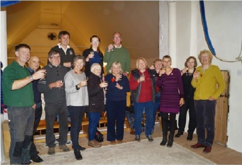
The 'Reedham Ringers' did a fantastic job marking the 100th Anniversary of the Armistice by ringing at 10.45am, 12.30pm and 7.05pm. Here some of the Ringers celebrate at the end of the day. Bells were also rung at Halvergate and Acle.