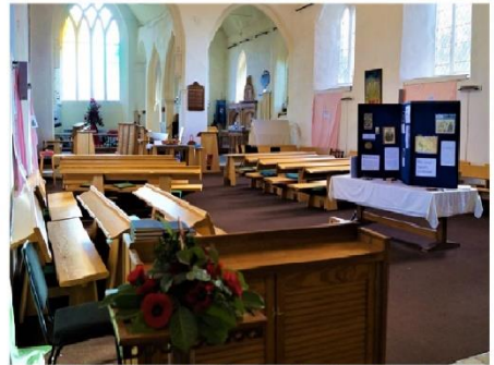
The World War I Exhibition at Reedham Church.