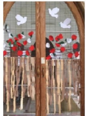
Right: Messy Church's display on the Wire Doors.