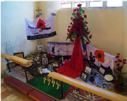
Top: Reedham School Display on WWI