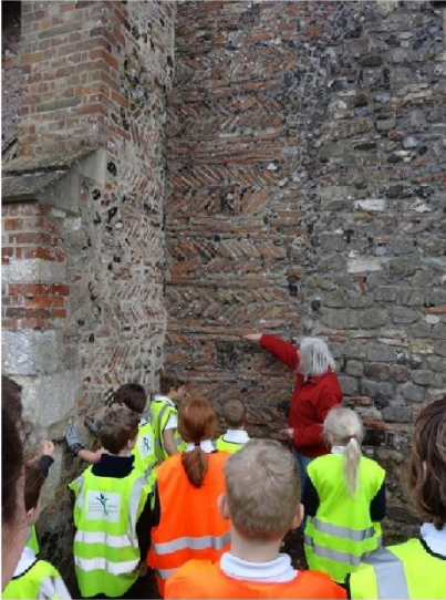
At the Churchyard Day on 20th March at Reedham, the school children hear about the history of the church building - see article.