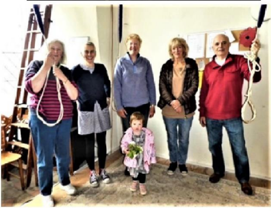
Above - Reedham Ringers greeting May Day with bells. Left - The Easter Fire is kindled - Tunstall Church on Easter Eve.

The Parish Magazine for the Churches of the Acle & Bure to Yare Benefice and Community Newsletter for Reedham and Area.