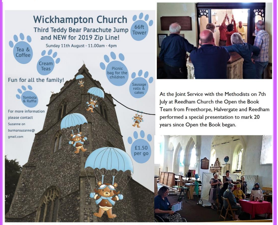
The Parish Magazine for the Churches of the Acle & Bure to Yare Benefice and Community Newsletter for Reedham and Area.

Editor's Note: Whilst the Editors welcome contributions to OUTLOOK magazine, the opinions and comments expressed by contributors are their own; we reserve the right not to publish all submissions.