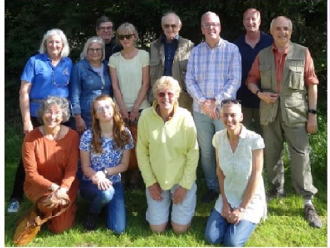
Reedham Ringers' Tour of Norton Subcourse, Haddiscoe and Ravingham Church Towers - with friends and Helpers.