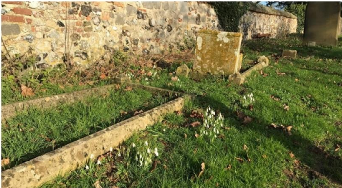
Bottom Left:- The snowdrops planted by Reedham School Children last year in Reedham Churchyard.