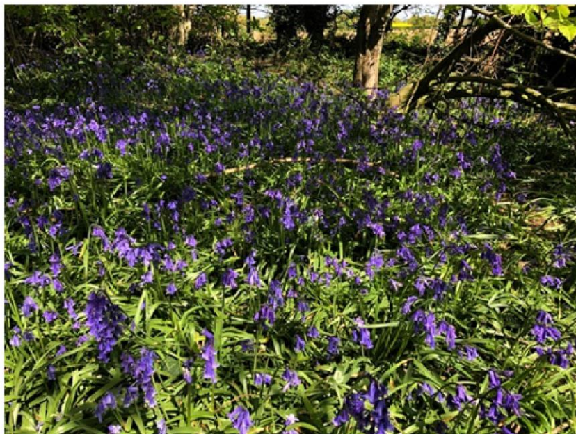
Bluebells at St Edmund's, Southwood - see article