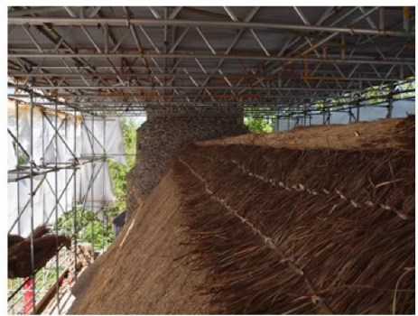
Above and Below - work nearing completion on Beighton church