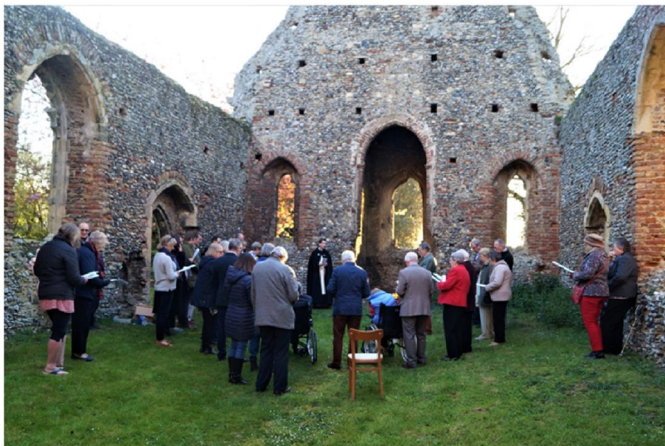
The lighting of the Easter Fire at Tunstall, Easter Eve 2019