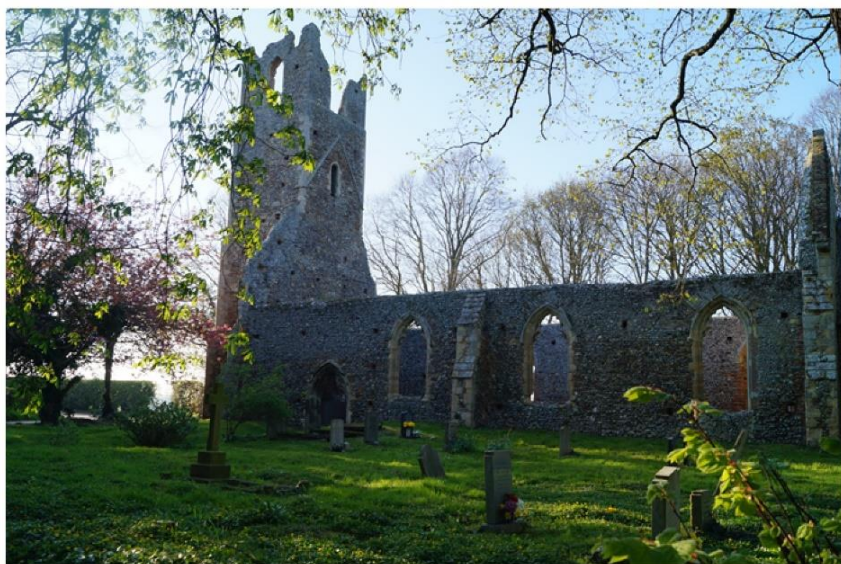
Below: Tunstall Church, Easter Eve