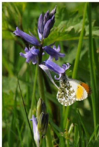
Left and below: Orange Tip Butterflies on Bluebell and Campion