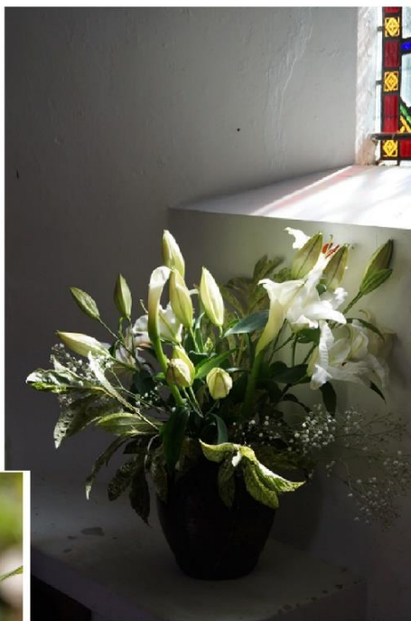
Above: Easter Lilies at Freethorpe, 2019