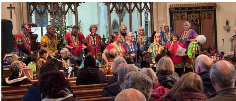
Above: The Happy Day Gospel Choir leading a Christmas Service at St Edmund's, Acle