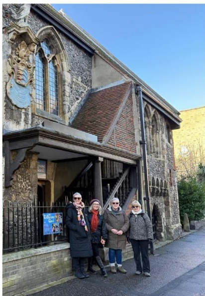
Left: Reedham Belles on a walking tour of Great Yarmouth.