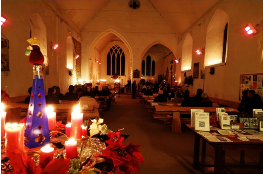
Reedham Carol Service with the Reedham Ringers Handbell Band.