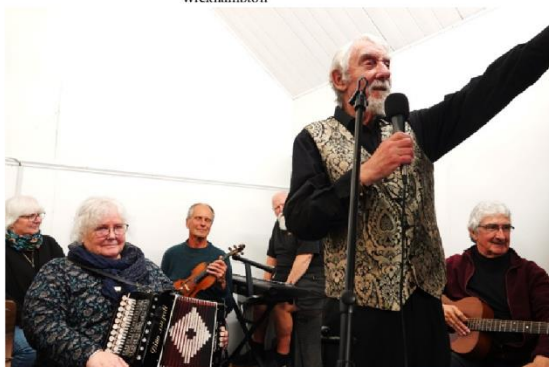
The Keel Band leading the Dancing at Beighton Ceilidh on 26th April, and the enthusiastic dancers in action (below).