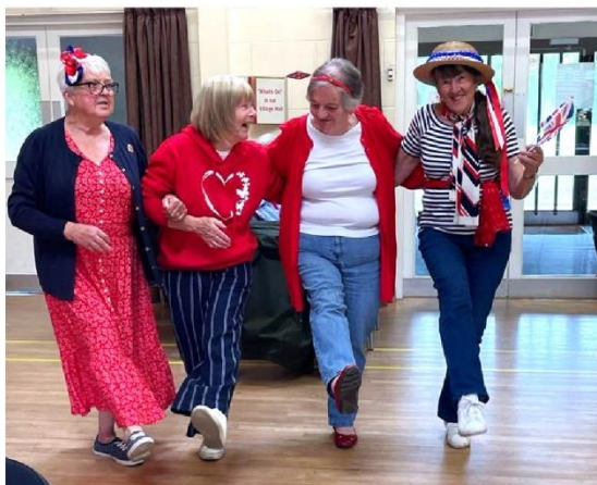
Above, left and right: The over 50s celebrate the VE Day anniversary.