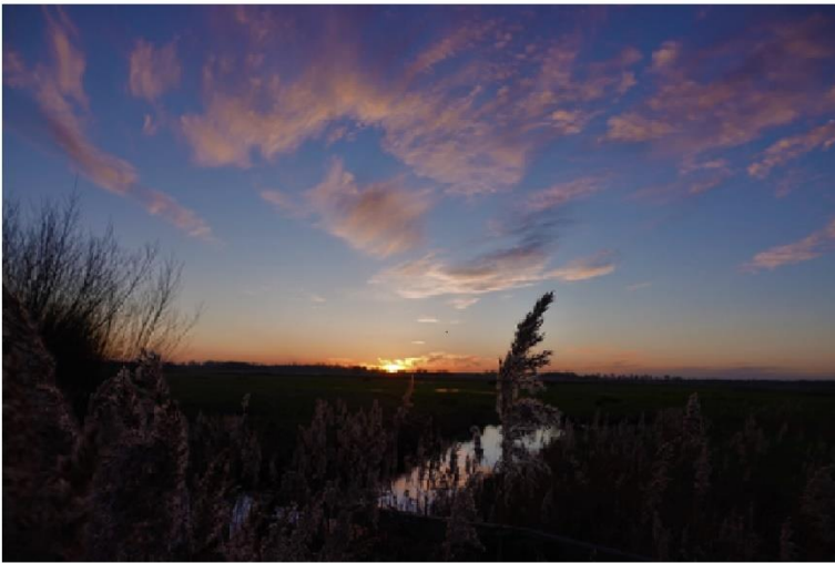
Sunset over Tunstall