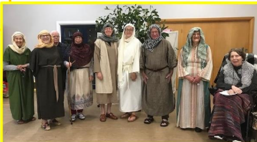
Right: 'The Motley Crew' - the Open the Book team at Freethorpe School.