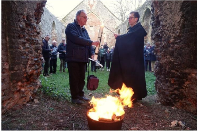
Above: Lighting the Paschal Candle at the Easter Fire Service, Tunstall.