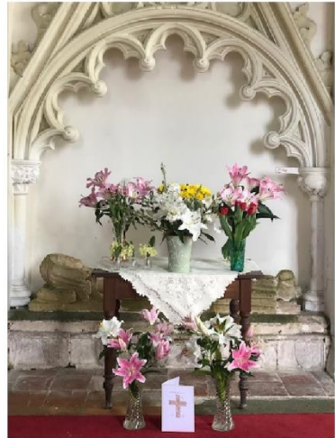
Below: Easter Flowers at St Andrew's, Wickhampton